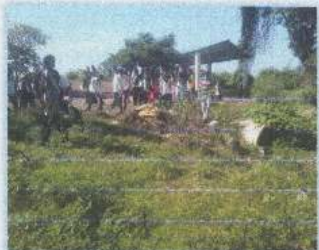
2) Participating students while cleaning