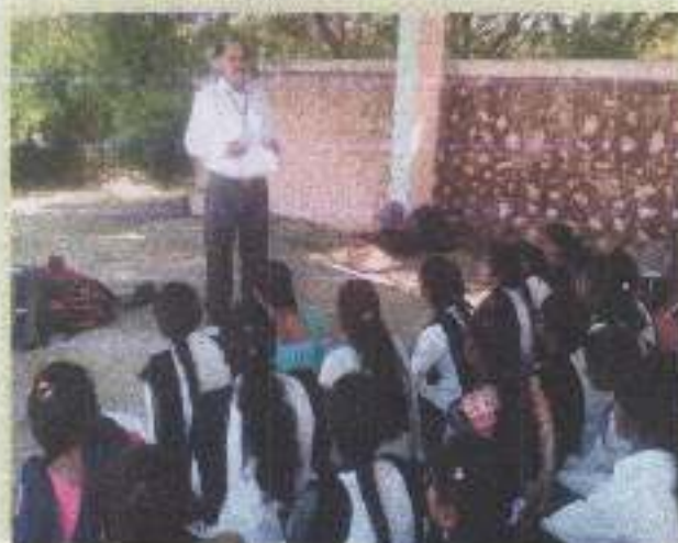
1) Principal, addressing to the participants