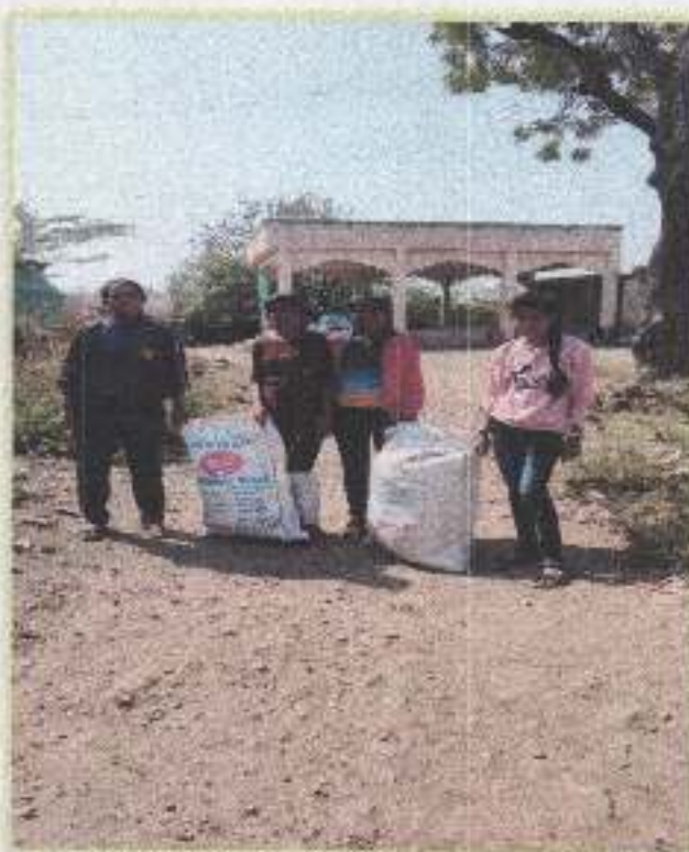
Student with Collected plastic at Tikhol Village 26 th March 2021