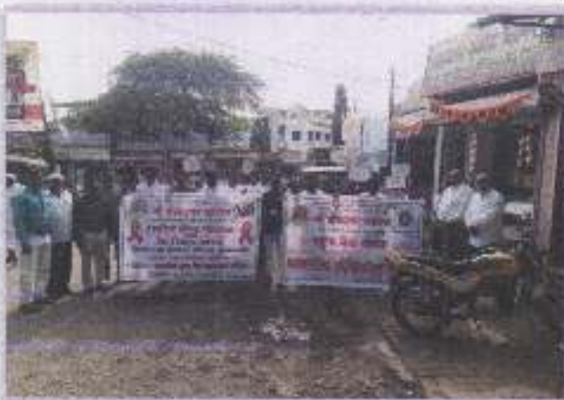
2) Participant with AIDS Flex