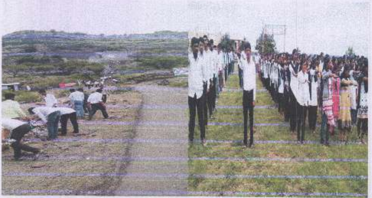
Rally of Swachha Bharat Swastha Bharat