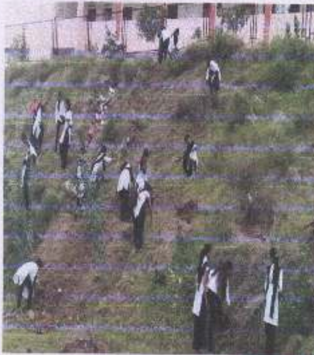
1) Cleanliness drive at College campus