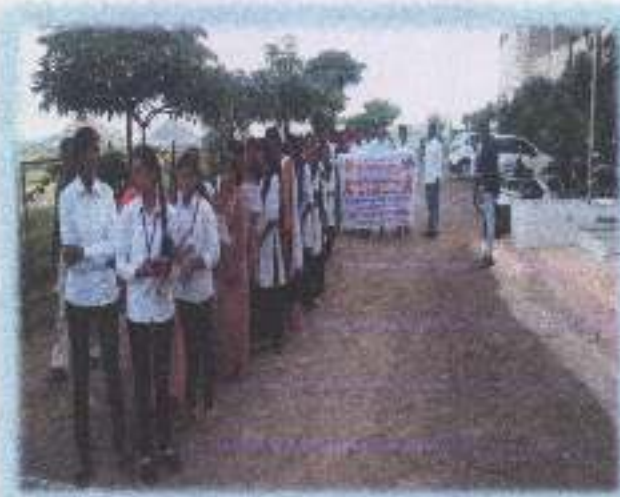
1) Student Participated in Rally