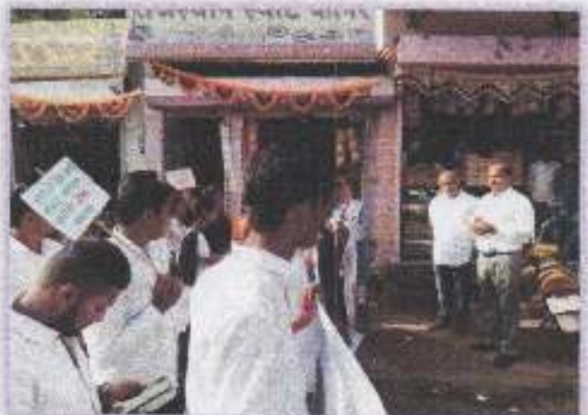
4) Principal, addressing to the participants