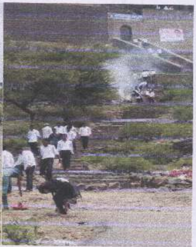
4) Cleanliness Drive at Dhokeshwar Caves